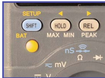
Easy to Understand Interface