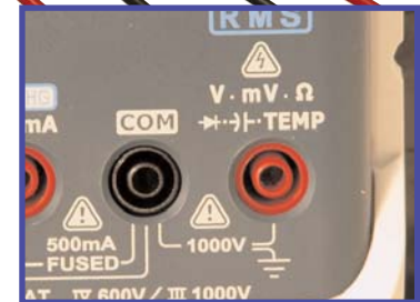
IEC Rated Inputs